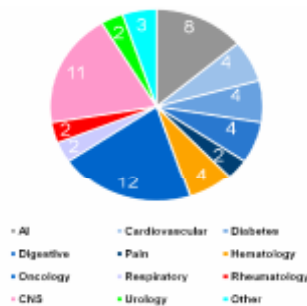
58 DMBS EPIs Studies